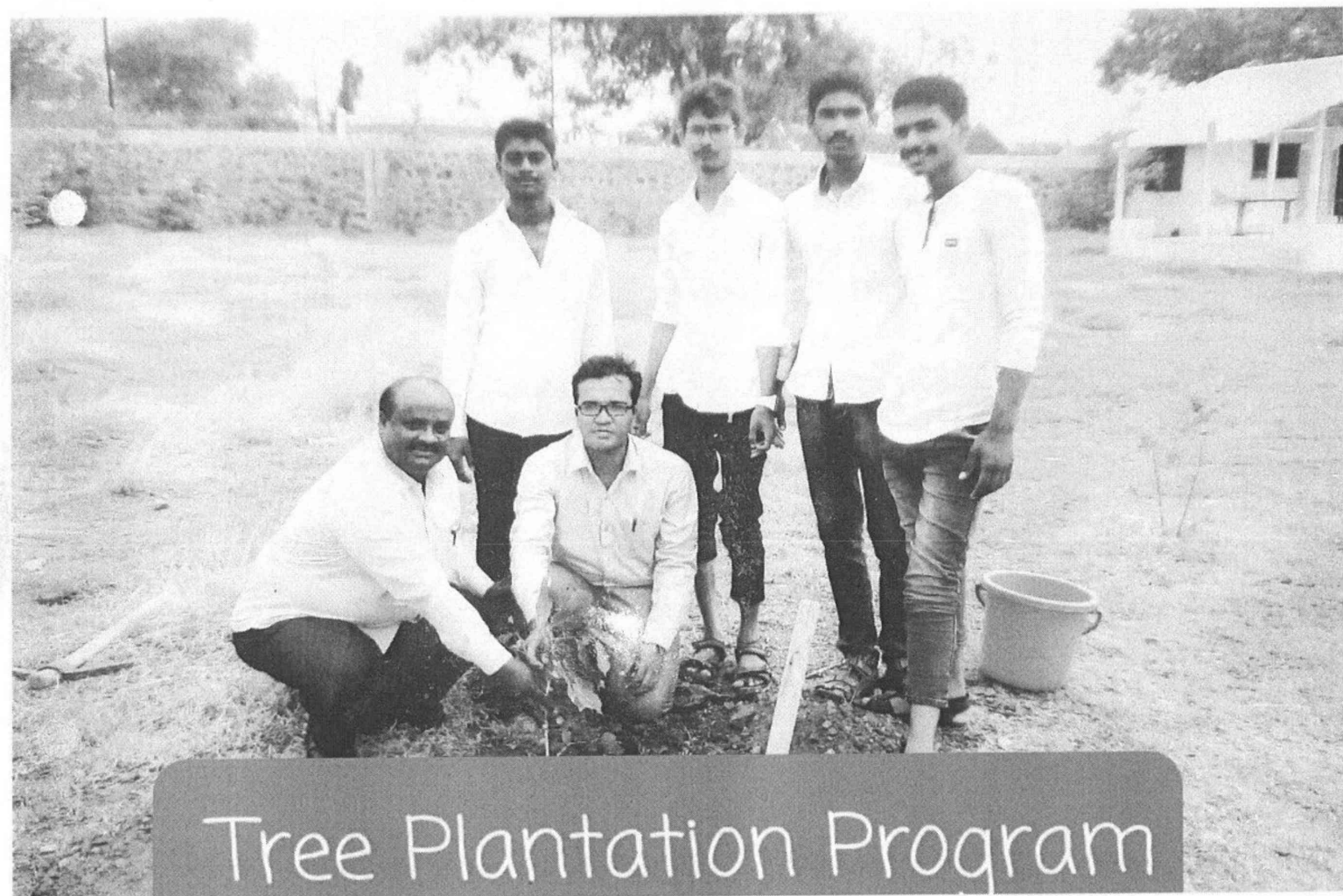
Tree Plantation Program