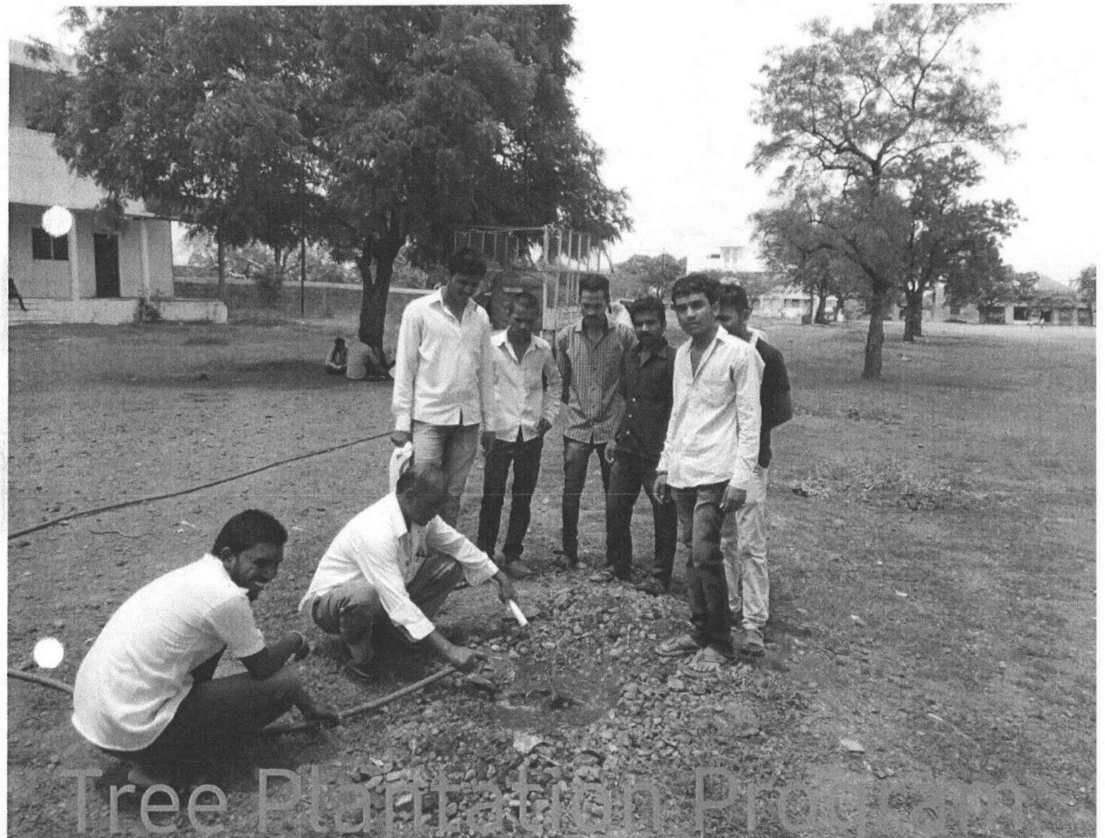
Tree Plantation Program